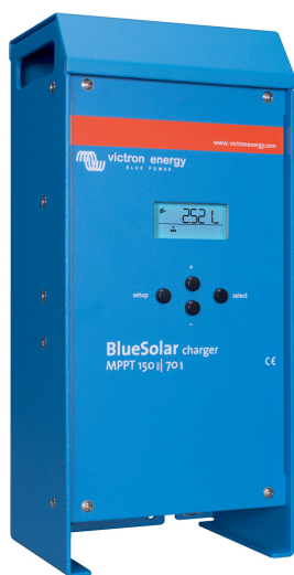
Solar charge controllers MPPT 150/70 and 150/85